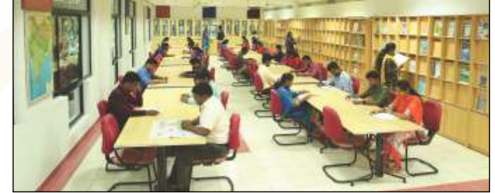
Library in two floors (4500 sq.ft.)