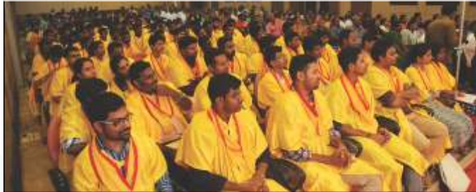
300-Seater A/C Auditorium