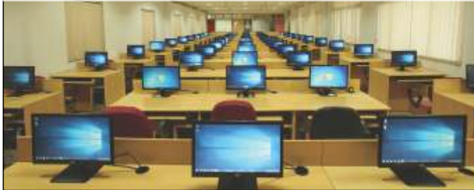
60 Computers in Computer Centre 24x7 Internet facilities