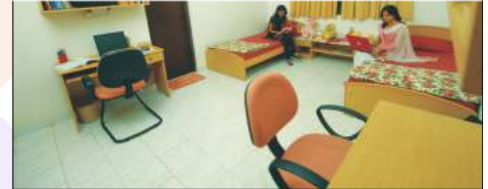
Separate & Spacious Hostels for girls & boys