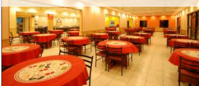
Hygienic Veg & Non-veg food in A/C Dinning Hall fitted with Modern Kitchen