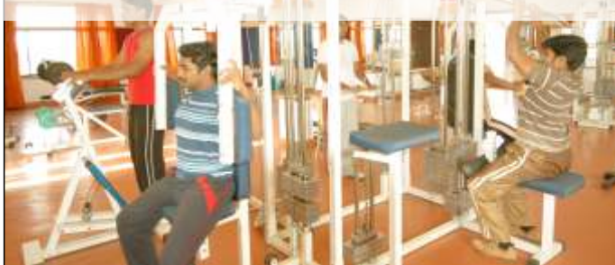
Separate Gym for girls & boys