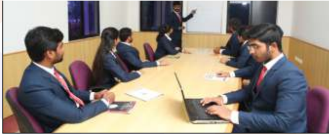
Six A/C Syndicate Rooms with corporate ambience