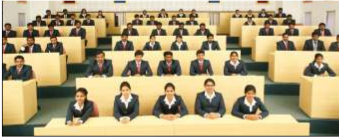
Four A/C Gallery-type Classrooms IT-enabled with Wi-Fi